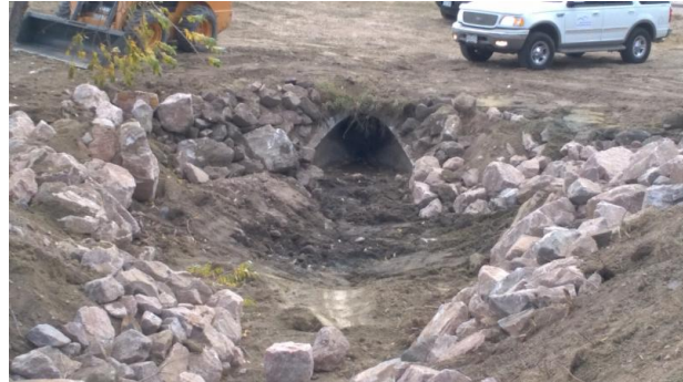
Storm drain culvert at the south loop of Allendale Drive

The first of several storm water drainage remediation projects was completed last month. The first phase of the project was planned for the southern portion of Filing 7 Tract C located near Allendale Drive and Litchfield Drive. This area was identified by the Board of Directors as having the highest priority for remediation. This phase of the project included the clearing and rebuilding of the storm water channel, erosion mitigation, and re-establishing the vegetation along the banks of the channel in the southern portion of the tract. The engineer's cost estimate for this phase was $67,332 if the project was outsourced and $32,487 if the District's staff completed the project with rented equipment.